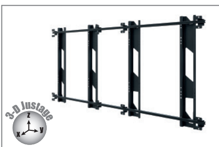
Fine adjustment possible on three axes