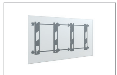
Mount invisible behind the devices